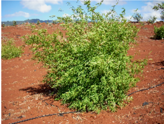
Bambusa oliveriana eight months after transplanting at Waipahu.