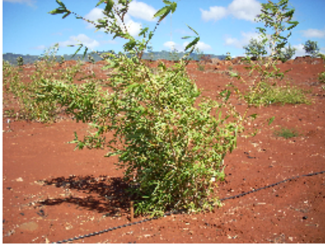
Bambusa heterostachya eight months after transplanting at Waipahu.