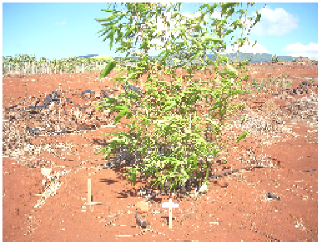
Bambusa lako eight months after transplanting at Waipahu.