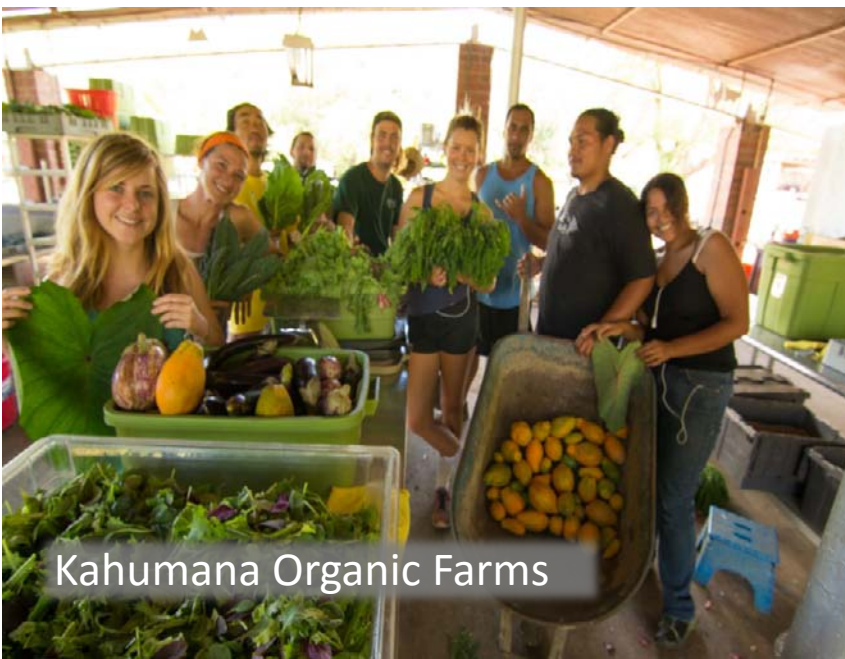
Kahumana Organic Farms